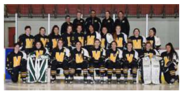
Female Team Manitoba NAHC 2018 Gold Medalists

Congratulations to the Manitoba teams that won GOLD and BRONZE medals at the NAHC 2018 in Membertou, Nova Scotia!